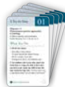
Mighty Minutes® (100 cards; also sold separately)