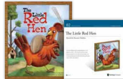
Children's Book Collection (5 fiction books, 6 nonfiction books, 4 big books)